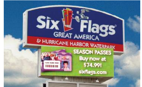
Bold, eye-catching, and durable - this Adaptive Excite™ 23mm display stands along I-94 outside Six Flags Great America (Gurnee, Ill.). It was installed by Jones Sign Co., Inc. of DePere, Wisconsin.

With this in mind, let's examine some of the more common myths surrounding digital display brightness.